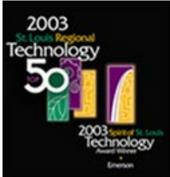
Cover Story, 2003 Spirit of St. Louis Science & Technology Award and St. Louis Regional Technology Top 50 Awards