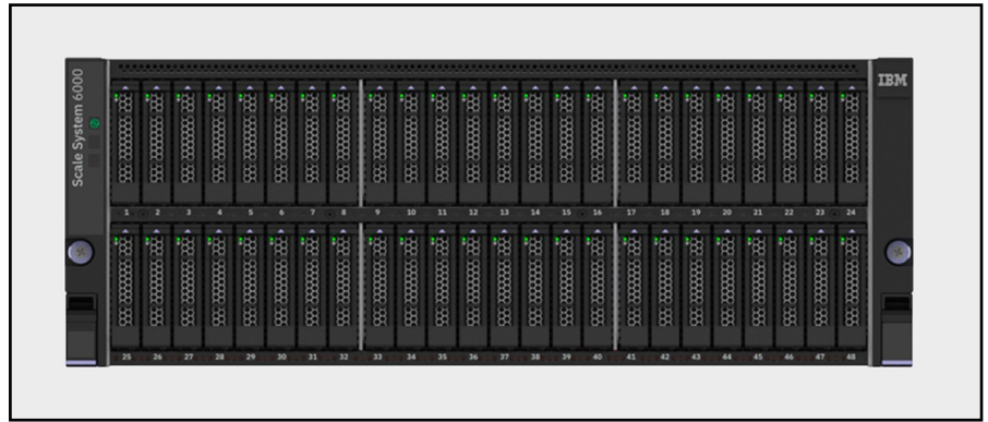
Figure 1 – The IBM Storage Scale System 6000 can deliver up to 310GB/s throughput, up to 13M IOPS, and up to 1.8PBe (effective capacity) in a 4U rack.

Storage Scale System 6000 is available in all-flash and hybrid configurations providing: