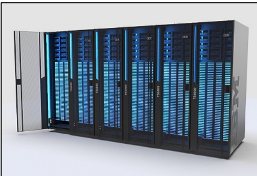
Figure 4 – The IBM Diamondback Tape Library delivers ultra-high data density, with up to 27.9 PB of native data in a single eight-square-foot library using LTO Ultrium 9 cartridges.