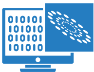
VIRTUAL DESKTOP INFRASTRUCTURE