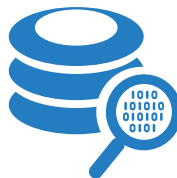
DATABASE & ANALYTICS